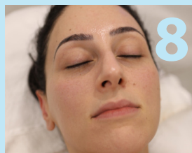
Massage finished with BB cream with 50SPF