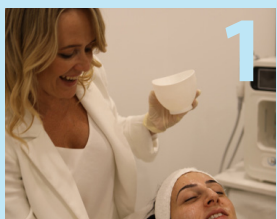
Consult & Cleanse

Treatment offers 4 modalities in 8 treatment steps